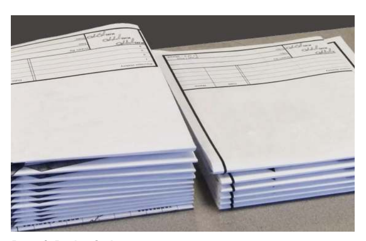
Portrait Packet Styles