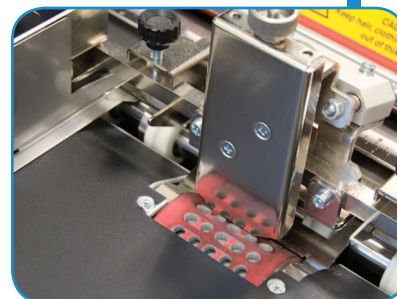
Rotating air-suction drum separates forms for accurate feeding